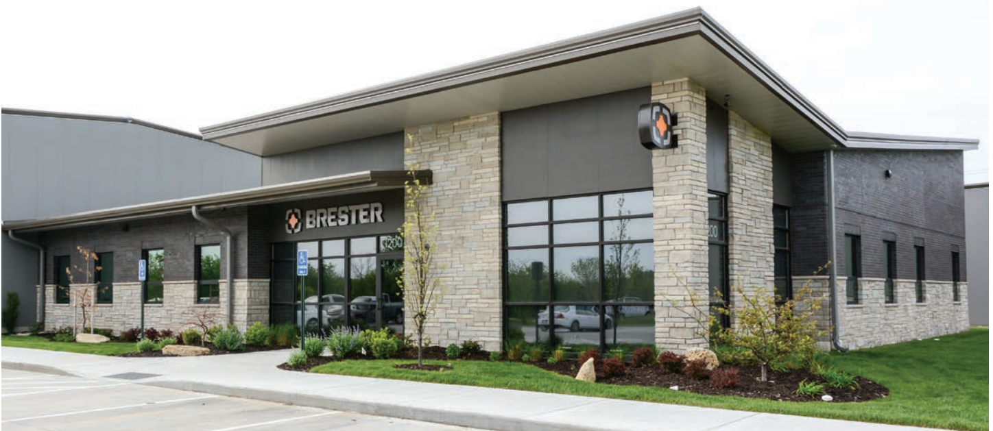
Brester Construction Corporate Office, Lincoln, NE