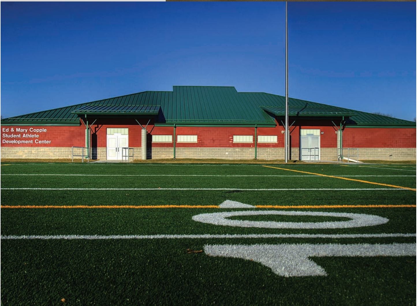
Ed & Mary Copple Student Athlete Development Center