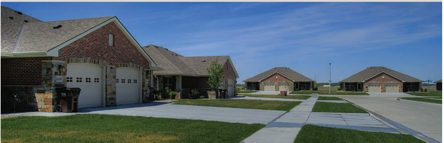
Liberty Estates, Waverly, NE