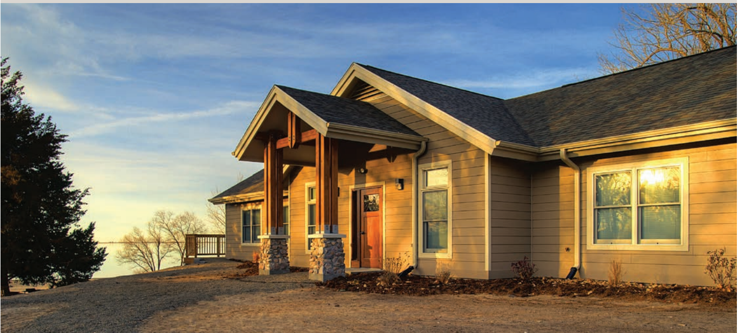
Hidden Valley Golf Course Club House, Lincoln, NE