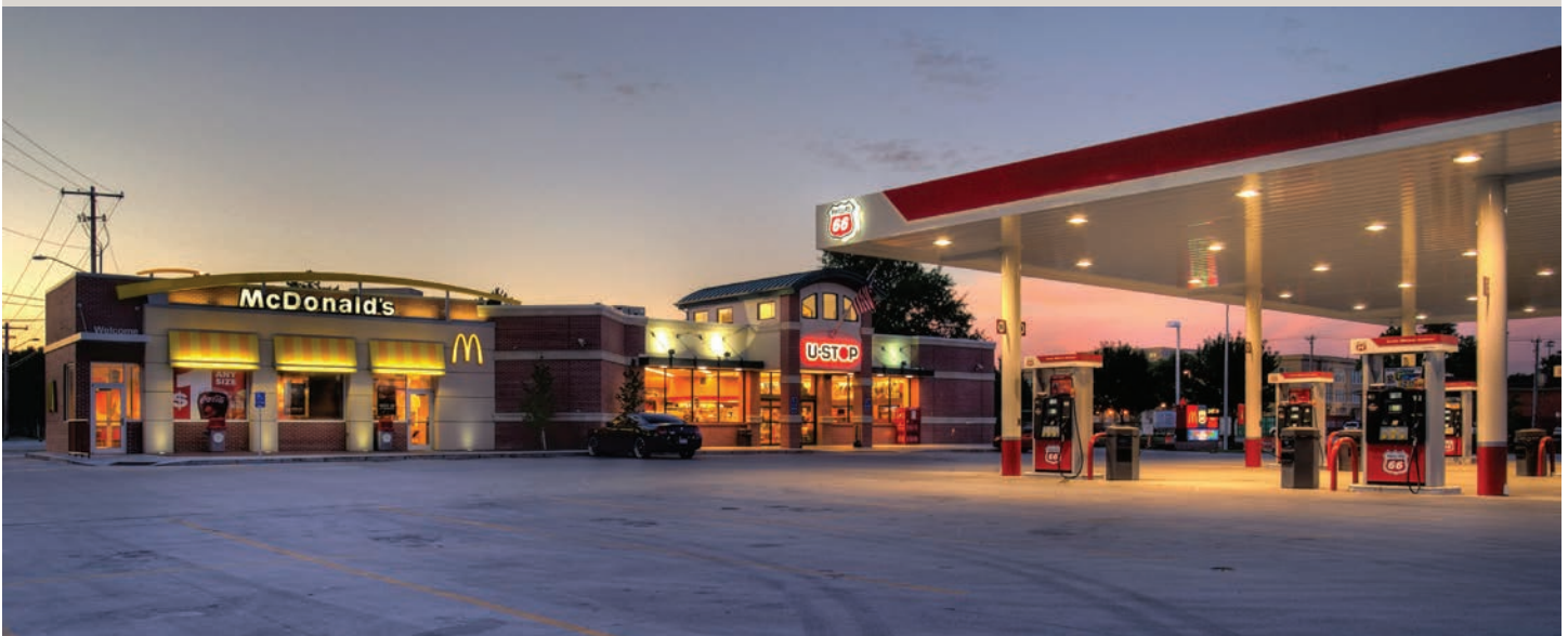
U-Stop & McDonald's, Lincoln, NE