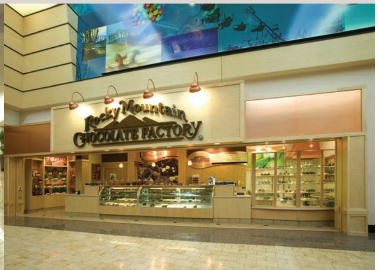
Gateway Mall Food Court Renovation, Lincoln, NE