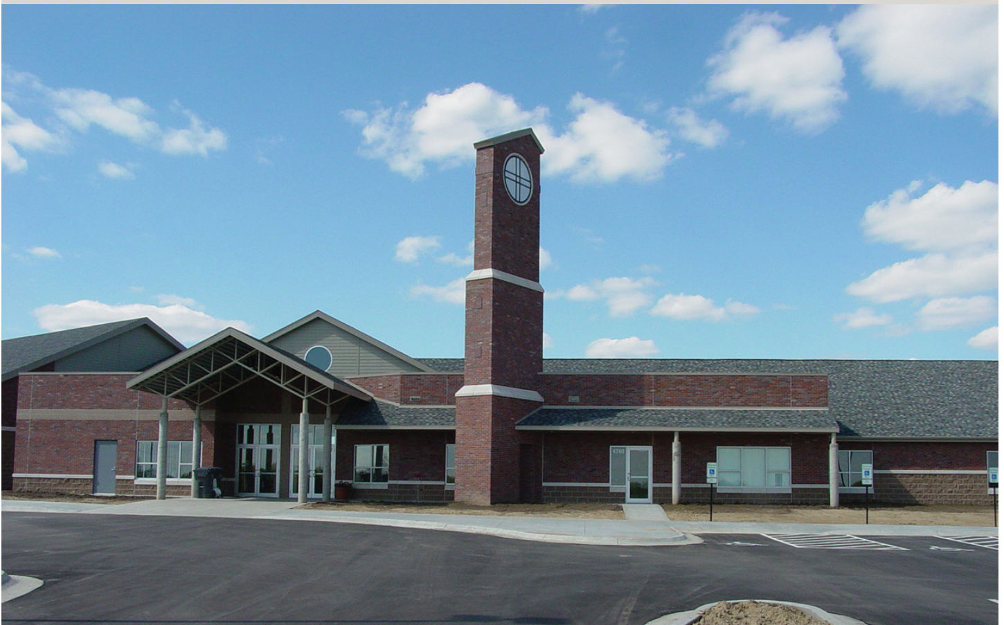
Hope Church, Lincoln, NE