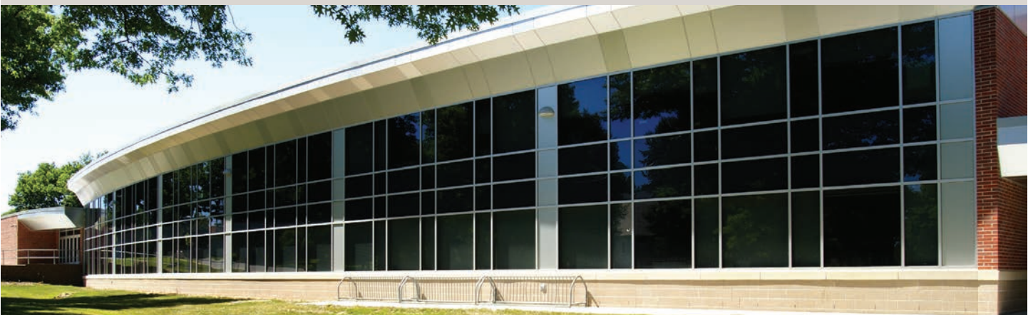
Mickle Middle School Addition & Renovation, Lincoln, NE