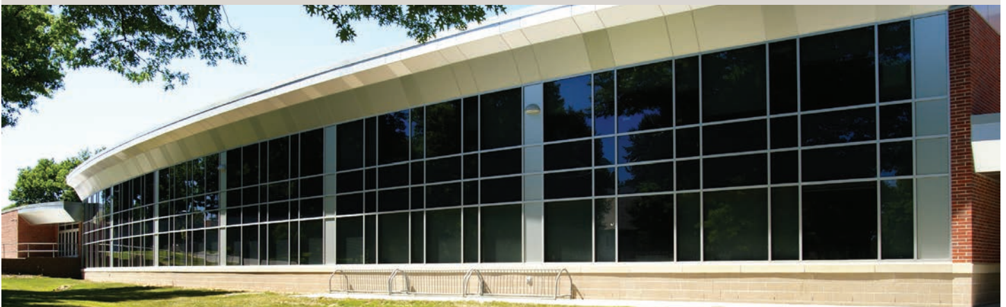
Mickle Middle School Addition & Renovation, Lincoln, NE