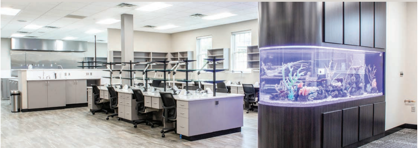
Dental Designs, Lincoln NE