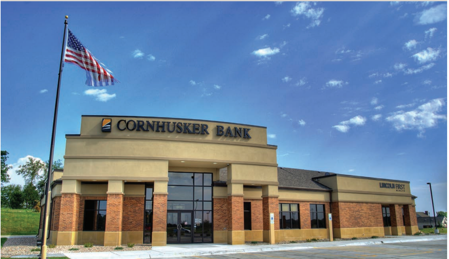
Cornhusker Bank, Lincoln NE