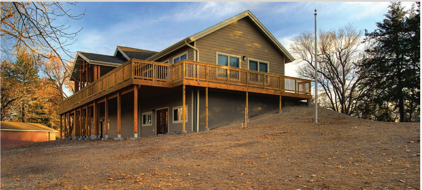
Hidden Valley Golf Course Club House, Lincoln, NE