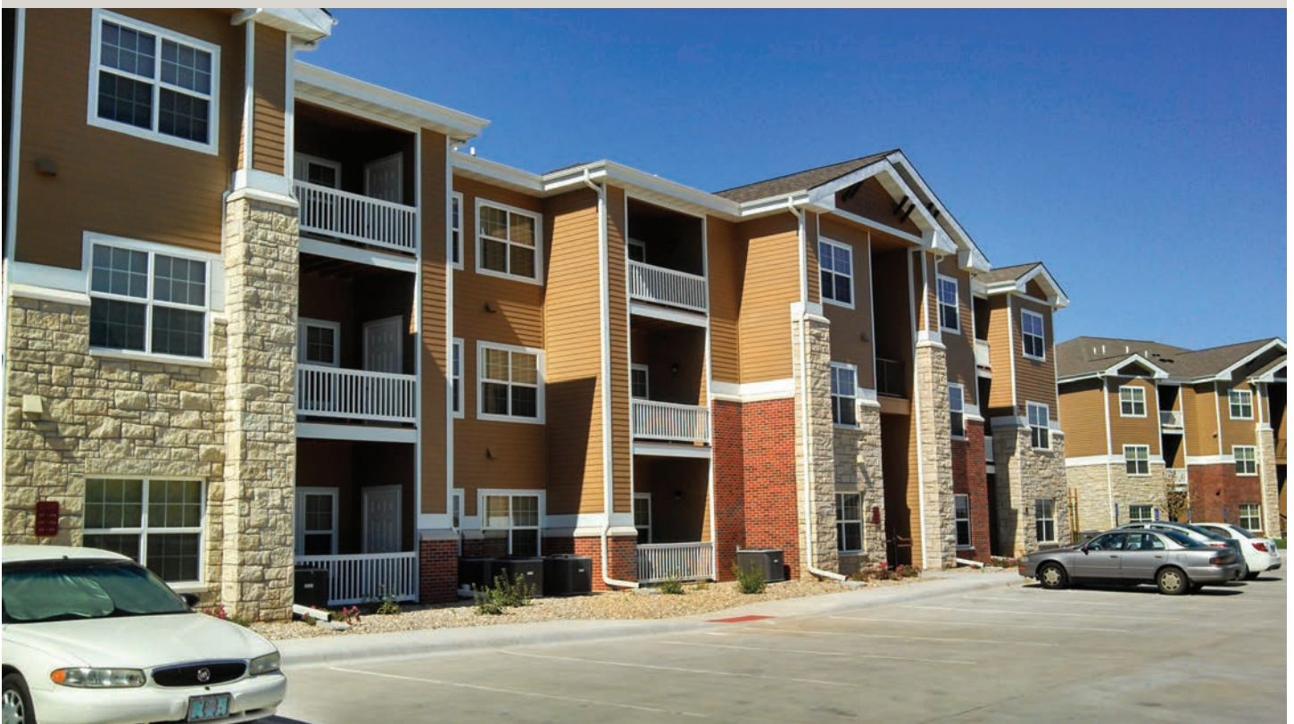
Scenic Pointe Apartments, Manhattan, KS