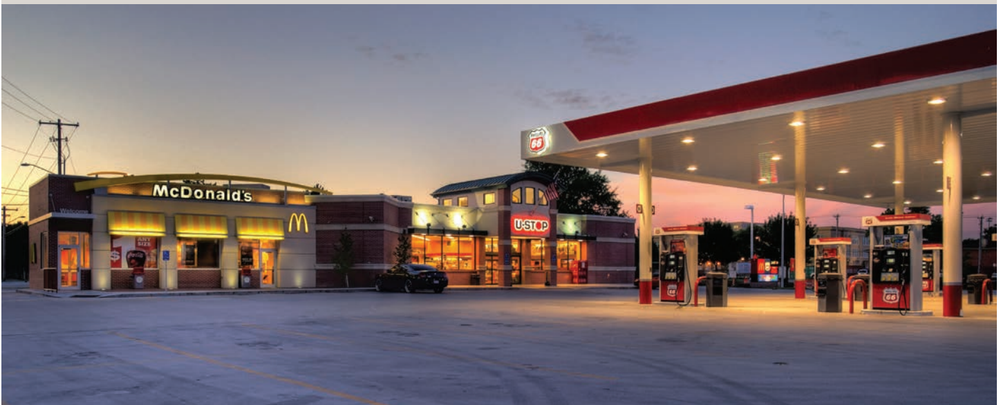
U-Stop & McDonald's, Lincoln, NE