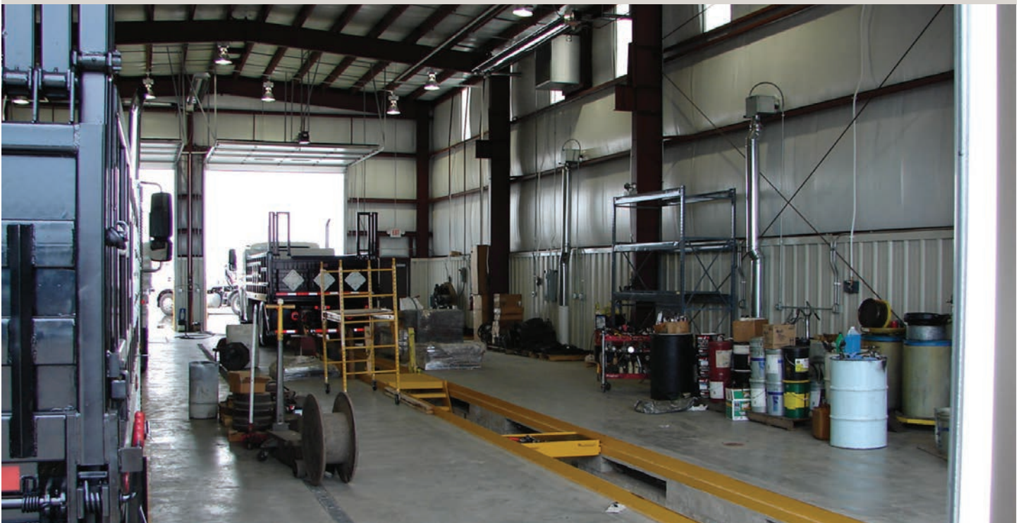
Linweld, Lincoln, NE