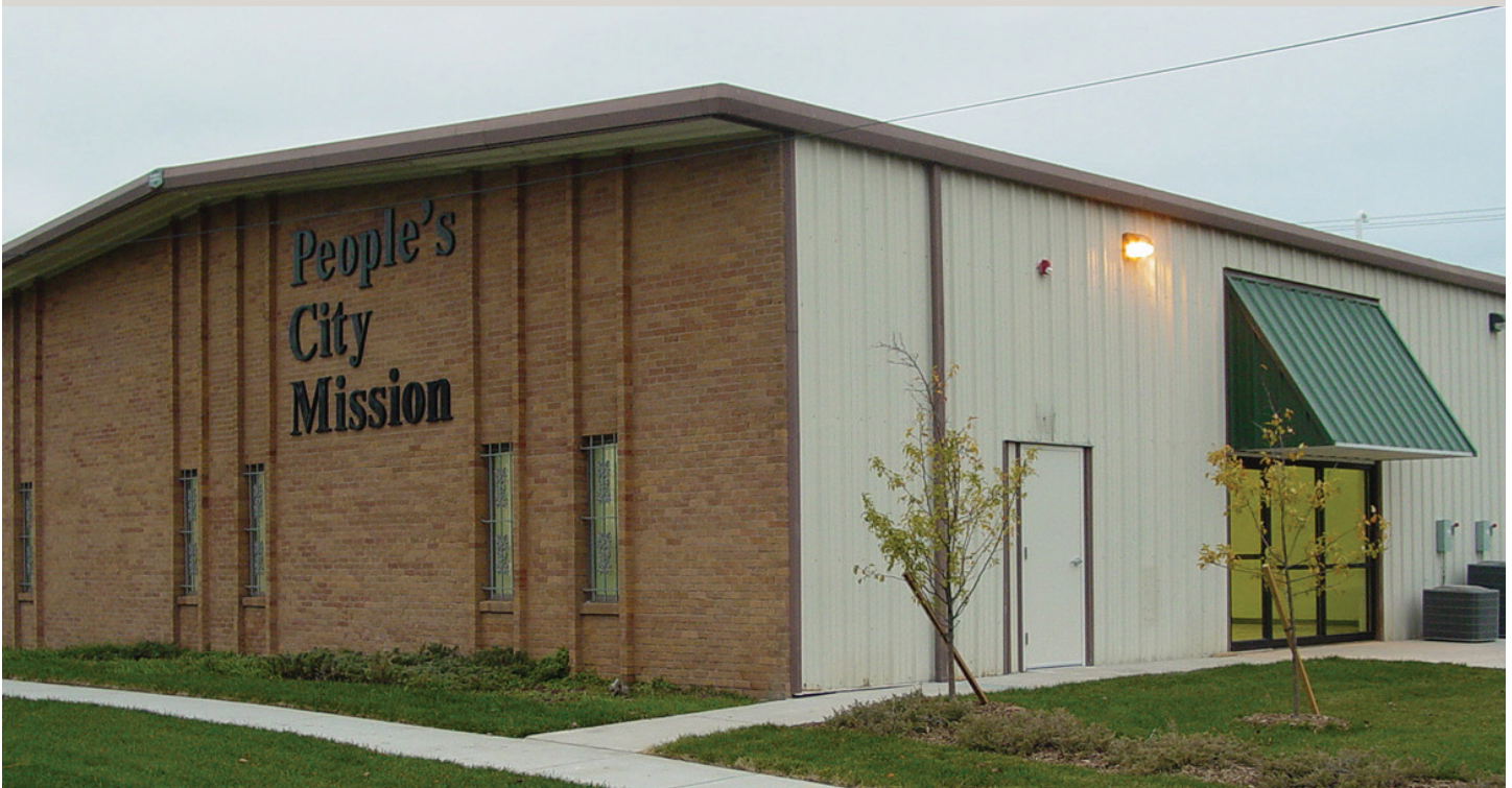
People's City Mission Homeless Intervention Center, Lincoln, NE